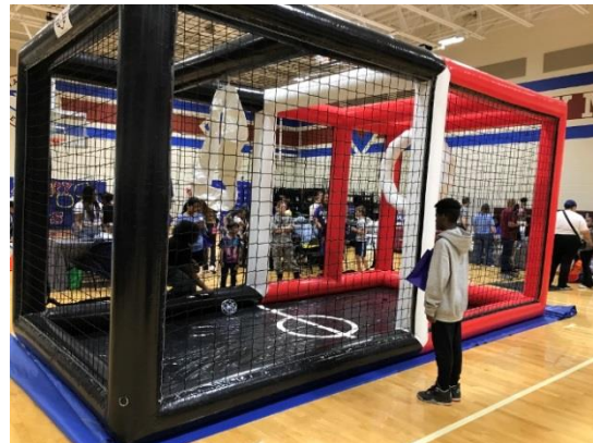
Drones were flown inside this blow up unit so they would not go all over the gym