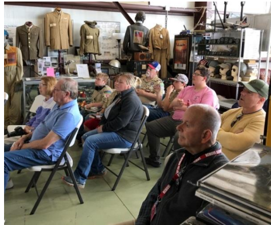
Visitors listening to the presentation