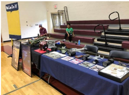
SCHAF table ready for visitors