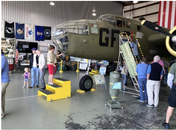
Visitors to the open house