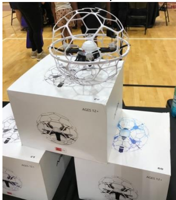
Drone inside protective covering so Kids can learn how to fly without breaking